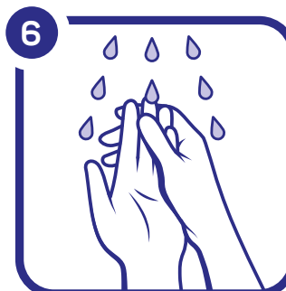
6 Wash hands afterwards