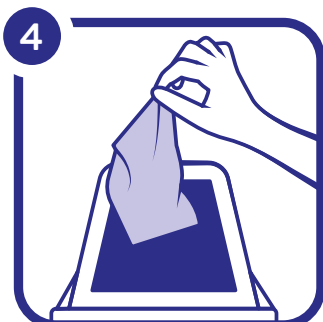
4 Dispose of the wipe in the bin. Single use only