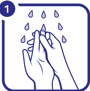
1 First, wash your hands