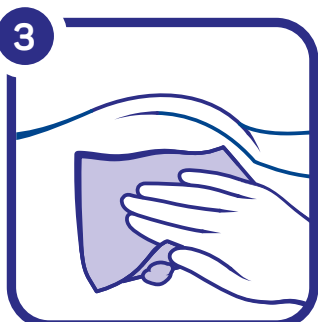
3 Clean the skin with the wipe. Always wipe front to back to avoid contamination

Suitable for sensitive and irritated skin